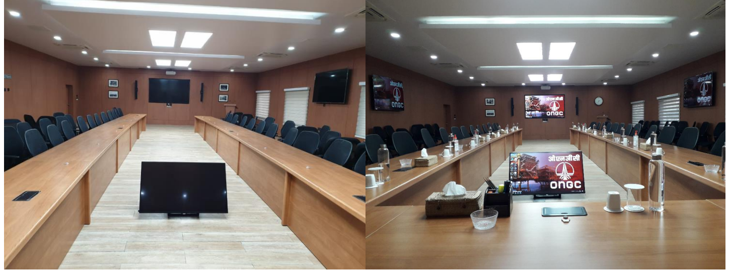
FUJITSUE – EXPERIENCE CENTRE - PUNE